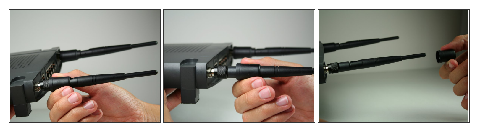
• Remove the black caps from the antennas by pulling them away from the device.